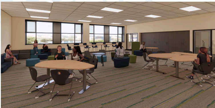
College and Career Readiness Wing