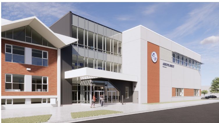
Expansion Exterior - Southeast View