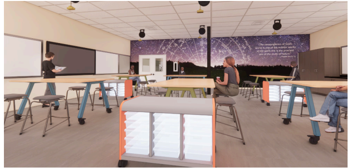
Makers Space STEM Wing

A look at some of our newest spaces in the building, including updated science labs, a "Makers Space" for hands-on learning, a college and career readiness center, and meeting rooms for current and prospective families, alumni, guests, and more.