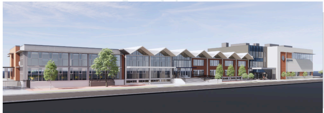
Building Exterior - View from Utica St.

A look at the updated Arrupe Jesuit entrance! By shifting the main entrance to the north side of Utica St., we're able to increase the security of the building, while helping the flow of traffic as we increase to 500 students in the coming years.