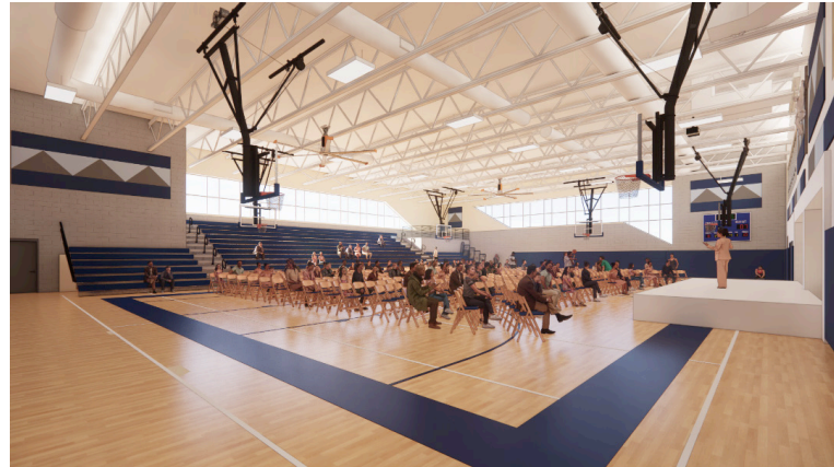
New Gymnasium - View 2

The gym will double as a gathering space for performances, assemblies, and more. We intend to explore options for more community events from the North Denver neighborhood to enhance our partnerships across the Metro Denver area.