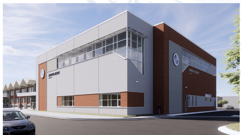
Expansion Exterior - Northeast View