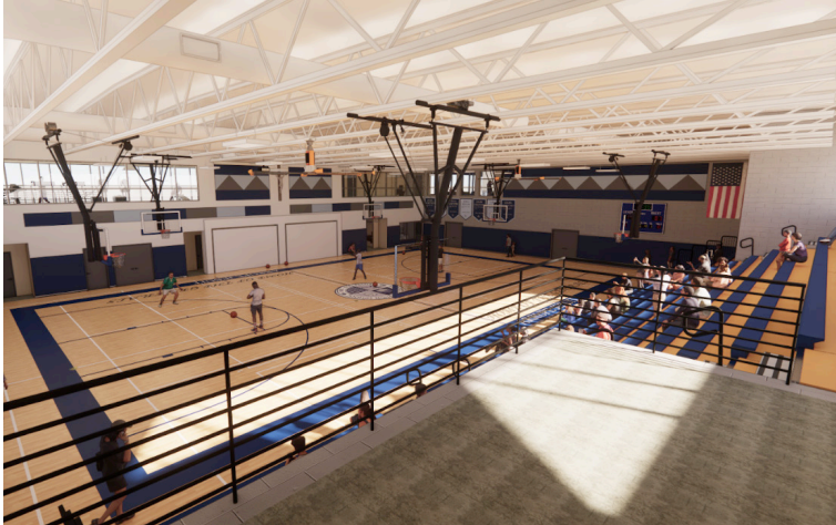
New Gymnasium - View 1

The updated gymnasium to be added to the north side of Arrupe's current campus will house enough seating for 500 spectators, our first ever locker rooms, a trainer's office, and a concession stand to encourage greater school spirit!