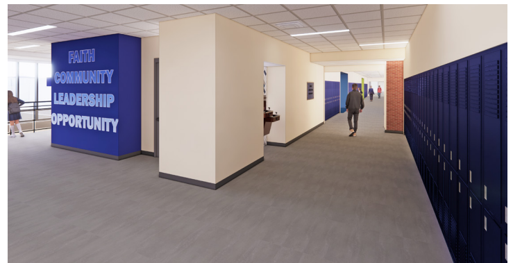
Second Level Corridor