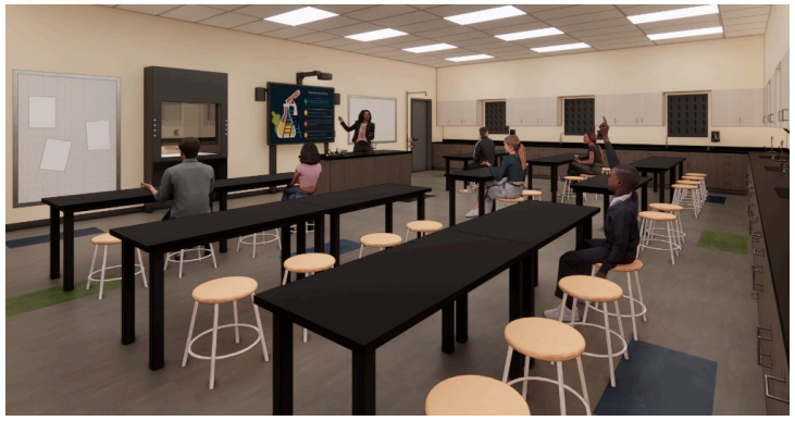
Lab in STEM Wing